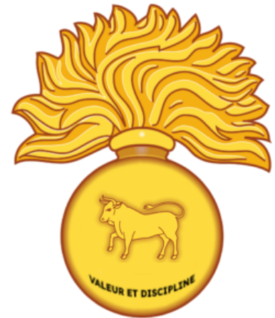
2nd Grenadiers Regiment