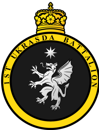
1st Ukrada Battalion

That said, below is the coat of arms of each battalion proposed for the Carolusburg Militia: