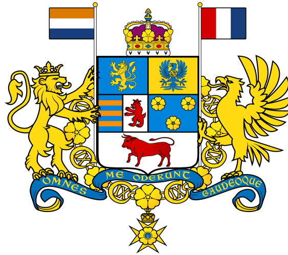
2.2. Greater Coat of Arms